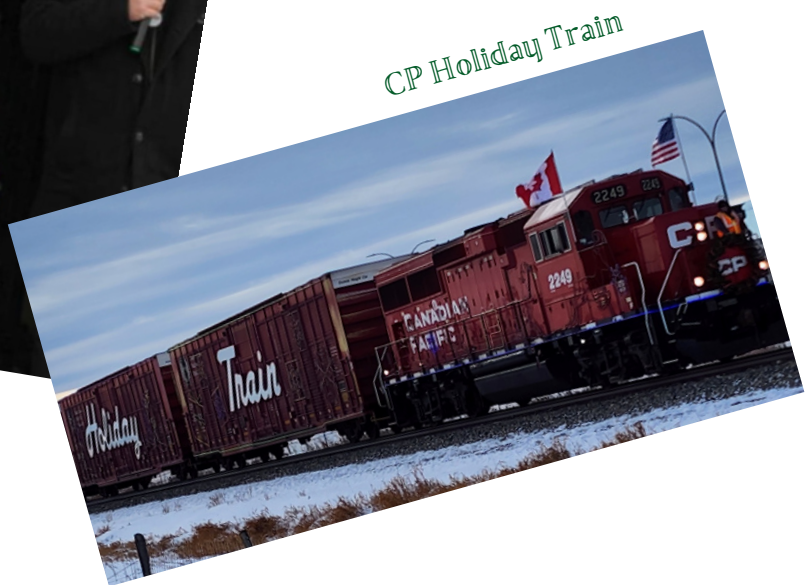
CP Holiday Train

We have been busy with all these activities, but we are blessed to serve our community and fill the needs of each person that comes in. Thank you to those who were able to help in whatever capacity you did; every bit of help is much appreciated! Thank you for your prayers and continued support for our Food Bank and our local community.